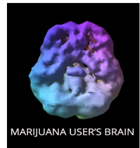
MARIJUANA USER'S BRAIN